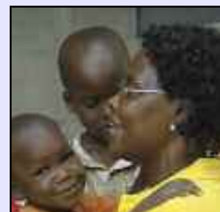
Hug the children of Haiti – page 6