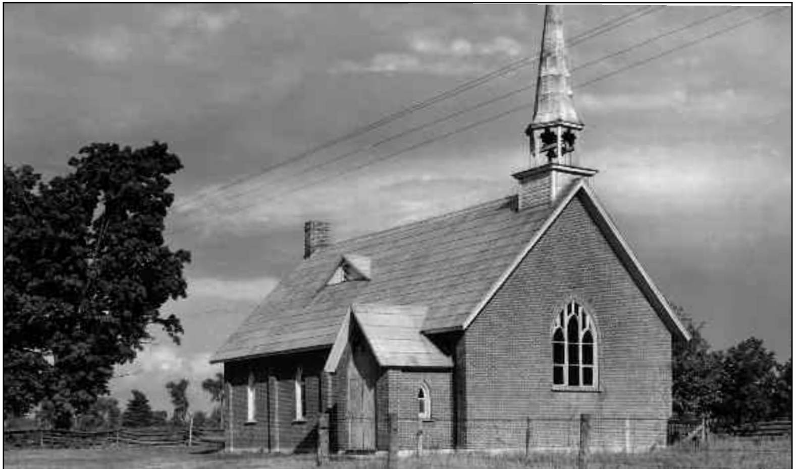
The original church on this site was consecrated in 1878 but later burned to the ground. This red brick church replaced it in the early 1900s.