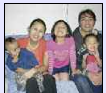
Refugee sponsorship – page 9