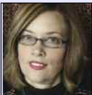
The GIFT of giving – page 3