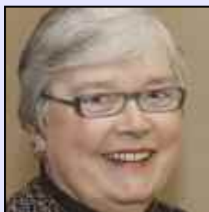
Energizing church volunteers – page 4