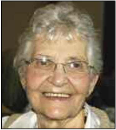
By Alix Delahaye